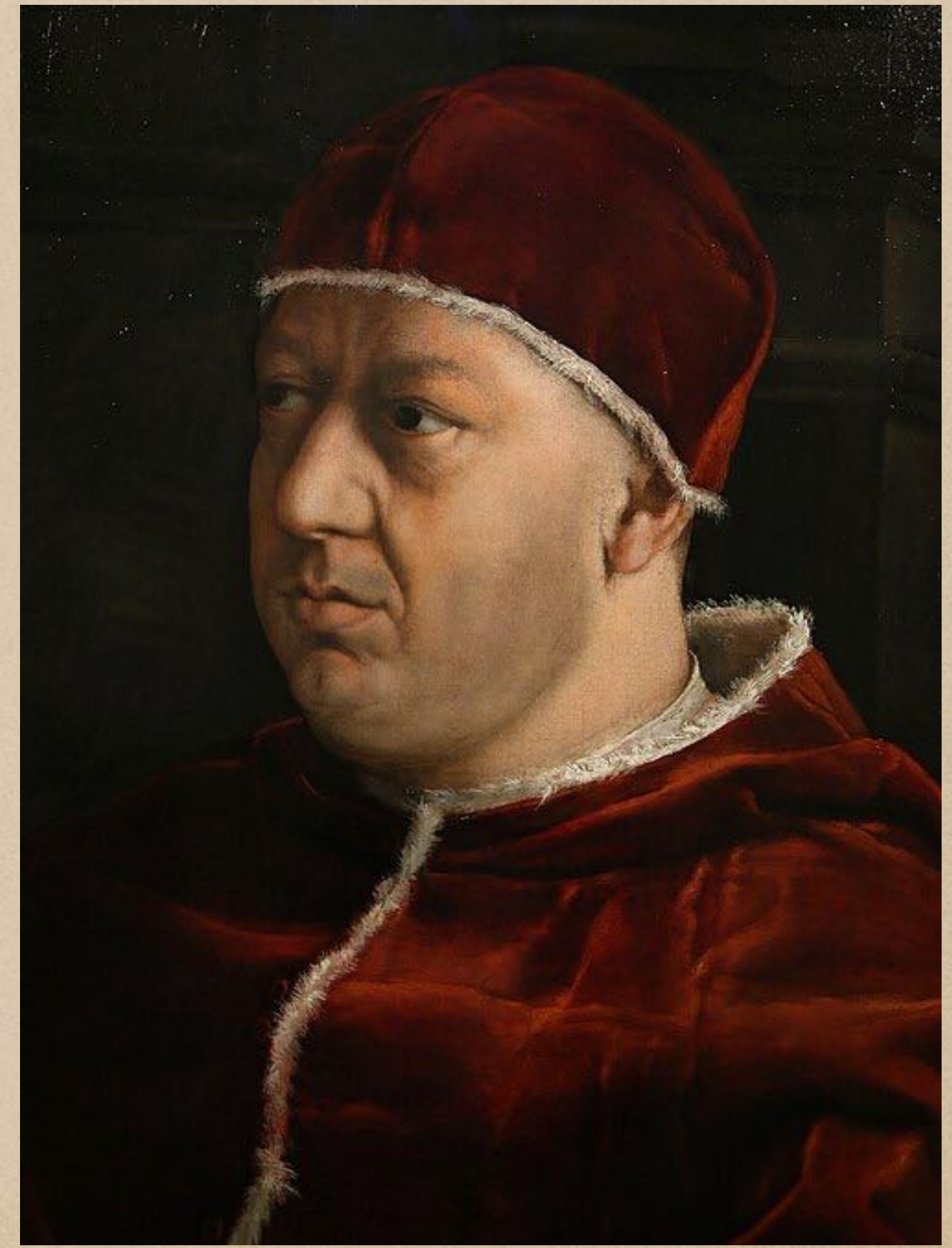
Pope Leo X