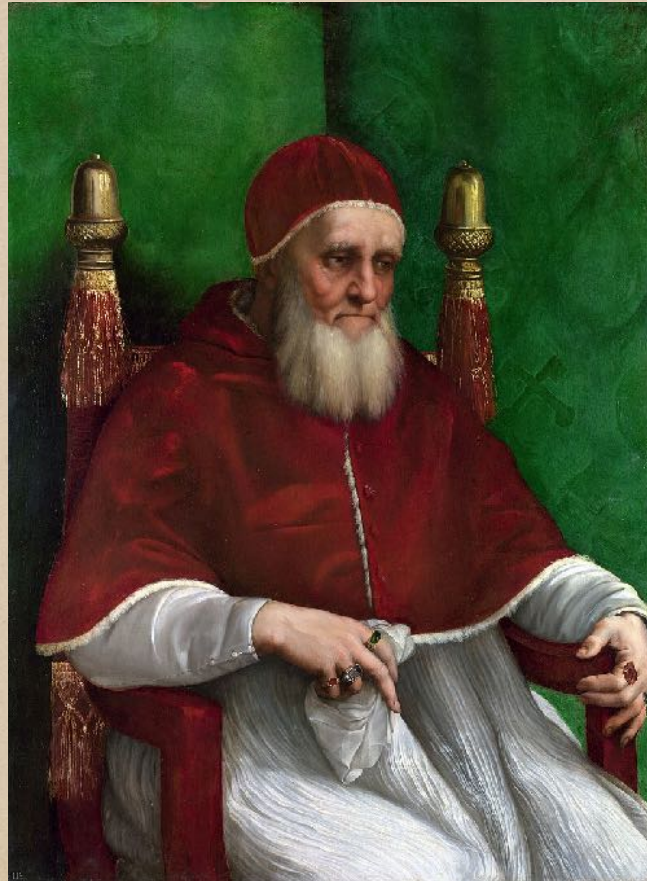
Pope Julius II