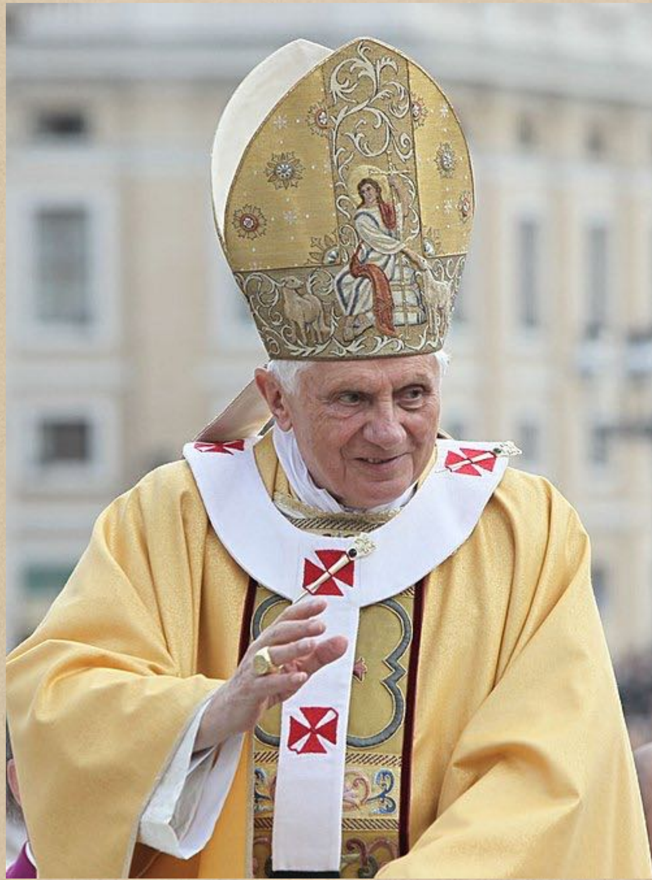
Pope Benedict XVI